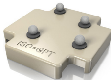
ISO Opt Frameless SRS Fiducial Array Frame Adapter