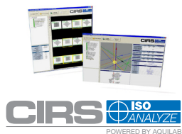
Software solution for auto image analysis of ISO phantom