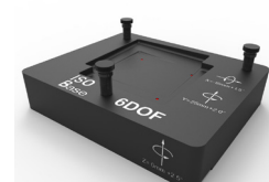
6DOF ISO Base™