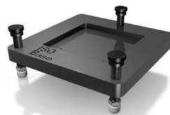
ISO Base™ Alignment Platform